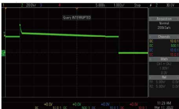
LDC302 28V abnormal voltage transients (overvoltage)